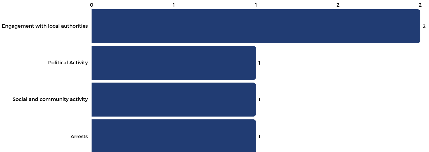
Chart 4: Areas of Activity of Popular Committees in Mixed Cities

The activities of popular committees in mixed cities are primarily focused on liaising with local authorities, along with engaging in political, social, and community initiatives. Notably, in the two cities where popular committees are absent, there are various active grassroots movements at the neighborhood and youth levels, although these initiatives are not structured within popular committees.