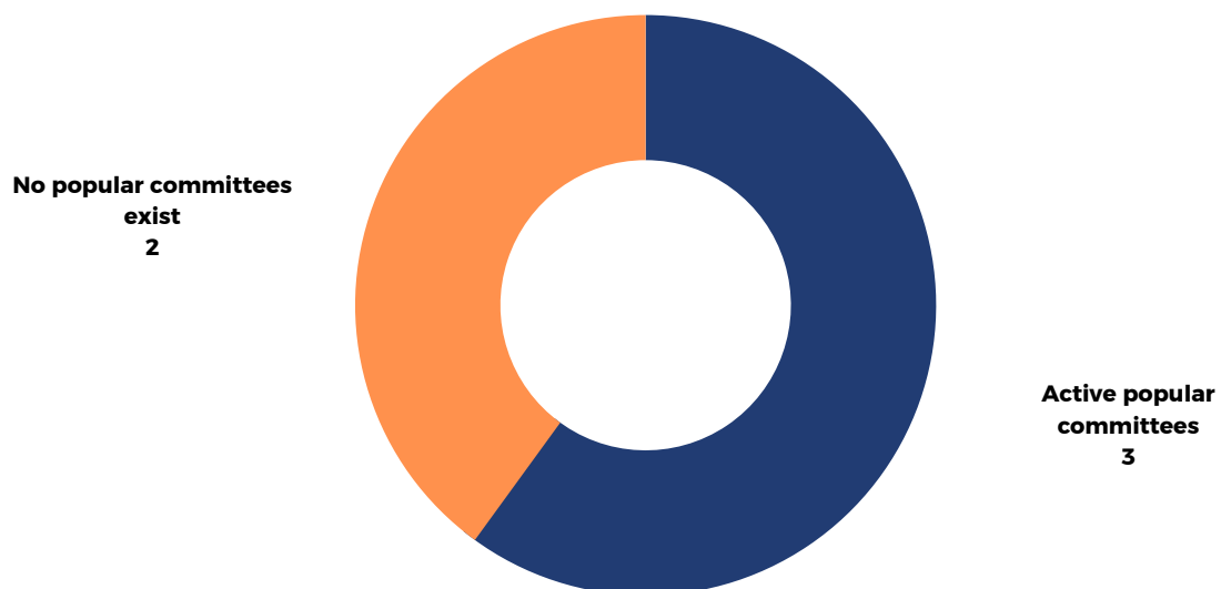
Chart 2: Mapping of Popular Committees in Mixed Cities

In addition to the Arab towns, the mapping included 5 mixed cities (Lod, Ramla, Tel Aviv-Jaffa, Acre, and Haifa). Based on the mapping data, there are 3 cities with active popular committees, while 2 cities do not have any popular committees.